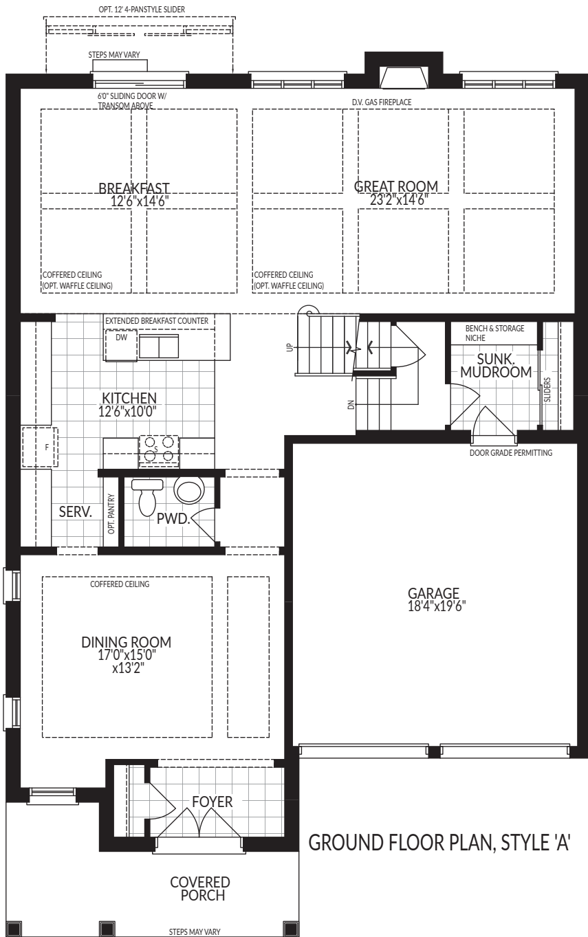
GROUND FLOOR PLAN, STYLE 'A'